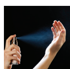
Maximist® 60° C180G 70° Turbo® TLV Turbo® TMV Turbo® THV