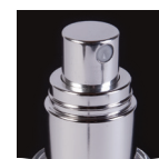
Elite Stepped 20-410, 22-410, 24-410