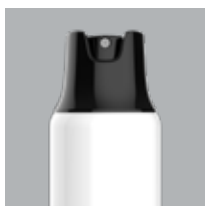
205 (58 mm)