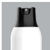
211 (66 mm)