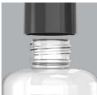
24-410 Glass Bottle