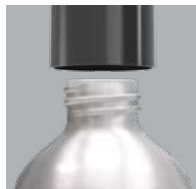
24-410 Aluminum Bottle