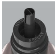
Engraving, Embossing, Decoration