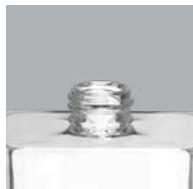
SNI 15, SNI 17, EU4, GCM1 15, CV13, CV15