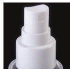
Essential Stepped (double skirt) 20-410