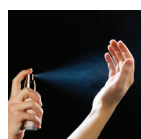
Maximist® 60° C180G 70° Turbo® TLV Turbo® TMV Turbo® THV