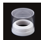
Muse (cap + collar for 1" ferrule)