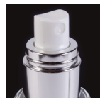
Premium Stepped (stepped overshell) 20-410, 22-410, 24-410