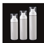
Venus 100, 120, 150 ml