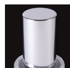
Metal Cap (for 18-400)