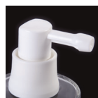
Essential Concave (double skirt) 18-400 with Spray Extender