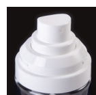
Venus Ø32mm Specific 32mm neck