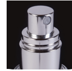
Elite Stepped 20-410, 22-410, 24-410