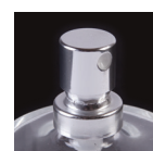
FEA Crimp Ferrule 13, 15, 17, 18, 20mm