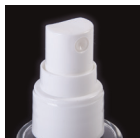
Essential Stepped (single skirt) 20-410, 22-410, 24-410, EUR 5