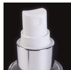
Premium Stepped (straight overshell) 18-400, 20-410