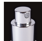
Elite Straight 18-400, 20-400, 20-410, EUR 5