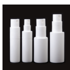
Sofistic's 5, 5, 10, 15 ml