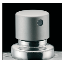
Metal 13H mm