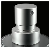
NN Standard HN High Nebulization