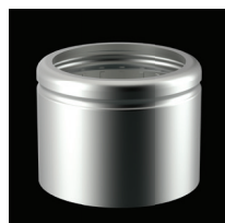
Upper Inner Bead (groove)