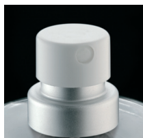
Plastic 13 mm, 15 mm