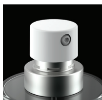
15 mm (FEA, GPI), 20 mm (FEA, GPI)