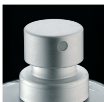
Metal 13 mm, 15 mm