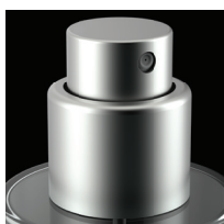
15 mm (FEA, GPI)