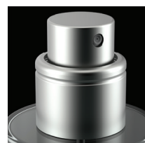
SNI 15 Bead Option