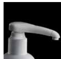
Kiwi Valve Head