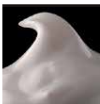
2.0 ml to 8.0 ml