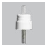
Snap (S20, GS20)