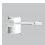
Throat adapter articulated 1