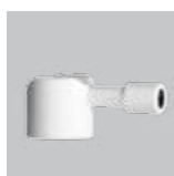
Throat adapter medium