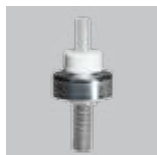
Ferrule (20 mm-gold or silver)