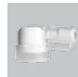
Throat adapter medium protection