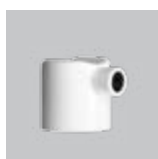
Throat adapter short