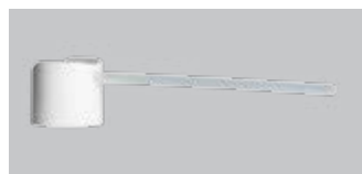
Spray head with capillary tube 2