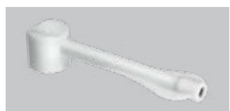
Throat adapter long with wings