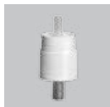
Screw (GL18 short, 18-415, GL20, 18-410, 22-415, GL18, PP18S)