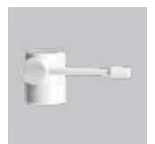
Throat adapter articulated 1