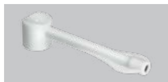
Throat adapter long with wings