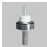
Ferrule (20 mm-gold or silver)