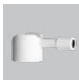
Throat adapter medium