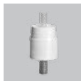
Screw (GL18, GL18 short, 18-410, 18-415, 20-400, GL20-grooved & smooth, 22-415, PP18S)