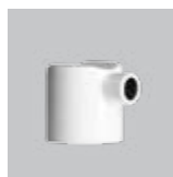
Throat adapter short