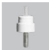
Snap (S20, GS20)