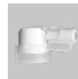
Throat adapter medium protection