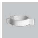
Safety clip 2