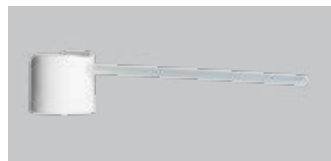
Spray head with capillary tube 2