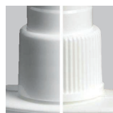
20-410, 22-415, 24-410 (smooth or ribbed)