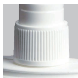
GL 20, 20-400 (ribbed)