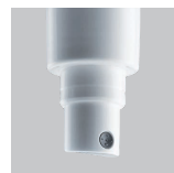
upside down (0.180 ml and 0.210 ml outputs) *upon available closure sizes