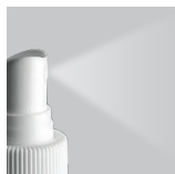
0.160 ml, 0.210 ml, 0.300 ml GS30, GS31: with 0.180 ml only